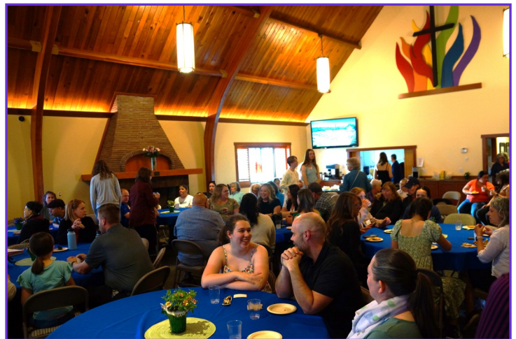
Family and friends of the honorees