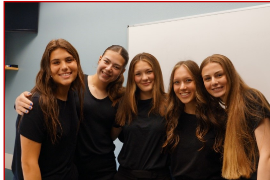
Thank you students of Port Susan Middle School, and Stanwood, Lakewood, and Everett High Schools for being excellent servers and models.