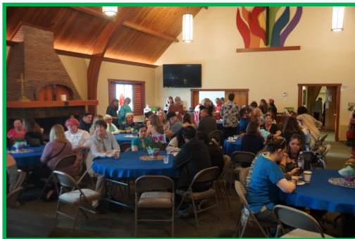
Family, counselors and members to support our scholars.