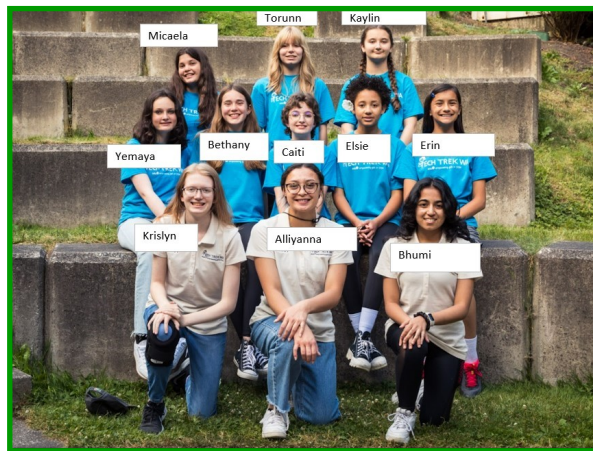
<- Dorm Buddies

Enjoy the photos of this year's camp below and see you on September 8.