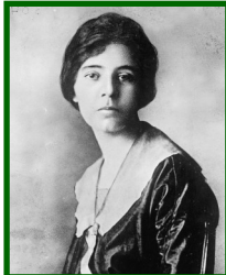
Alice Stokes Paul