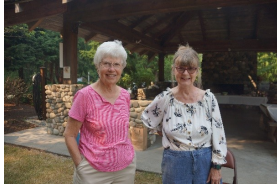
Martha and Mary