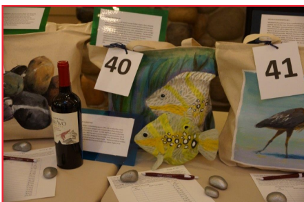
Artist-decorated Canvas Bags