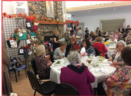
Live Auction Item Display