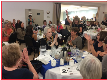
Winner, Winner, Winner