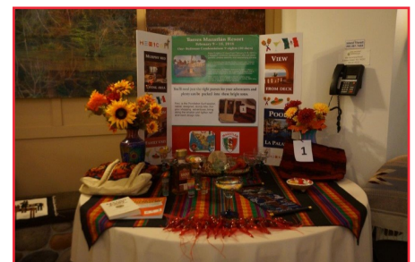
Mazatlán Condo Raffle