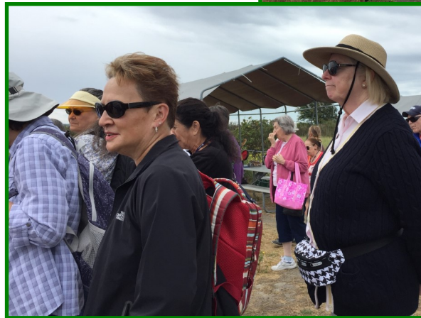
Jetty Island, August 16