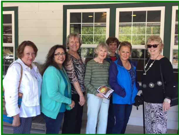
Pilkington Studios and Lunch at the Crow's Nest, August 17