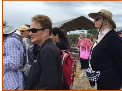
Jetty Island August 2017