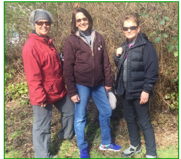
Day Tripper Outing February 22 Cama Beach State Park Loop Trails