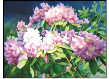
One of the 2016 winners

"We hear about the gender gap all the time: in salary, in math and science fields, and in leadership. One of the most glaring and longstanding gaps is in the art world. For centuries, women artists were unrecognized, unencouraged, or even discredited simply because they were not men," states the AAUW website.