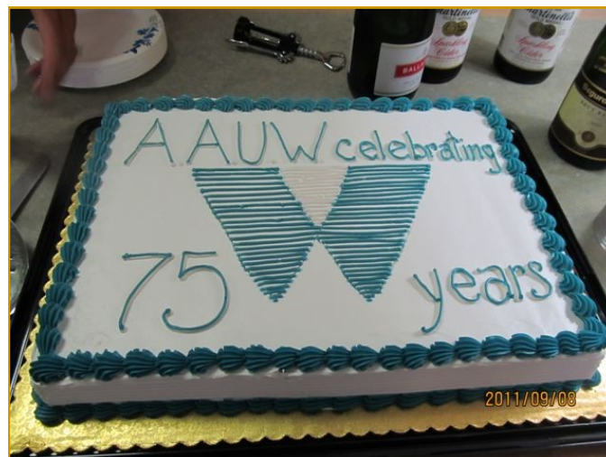
Celebratory Cake & Champagne at September 8 Meeting

In 1945, members were sponsoring women from war-liberated countries to come to the U.S. to study.